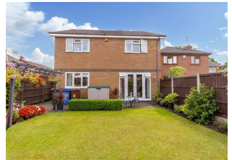
11 BUSHY CLOSE, LONG EATON

Whilst every attempt has been made to ensure the accuracy of the floorplan contained here, measurements of doors, windows, rooms and any other items are approximate and no responsibility is taken for any error, omission or mis-statement. This plan is for illustrative purposes only and should be used as such for any prospective purchase. The services, systems and appliances shown have not been tested and no guarantee as to their operability or efficiency can be given. Made with Metropix ©2022